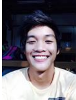
Czharl Sargento Internal Affairs Committee